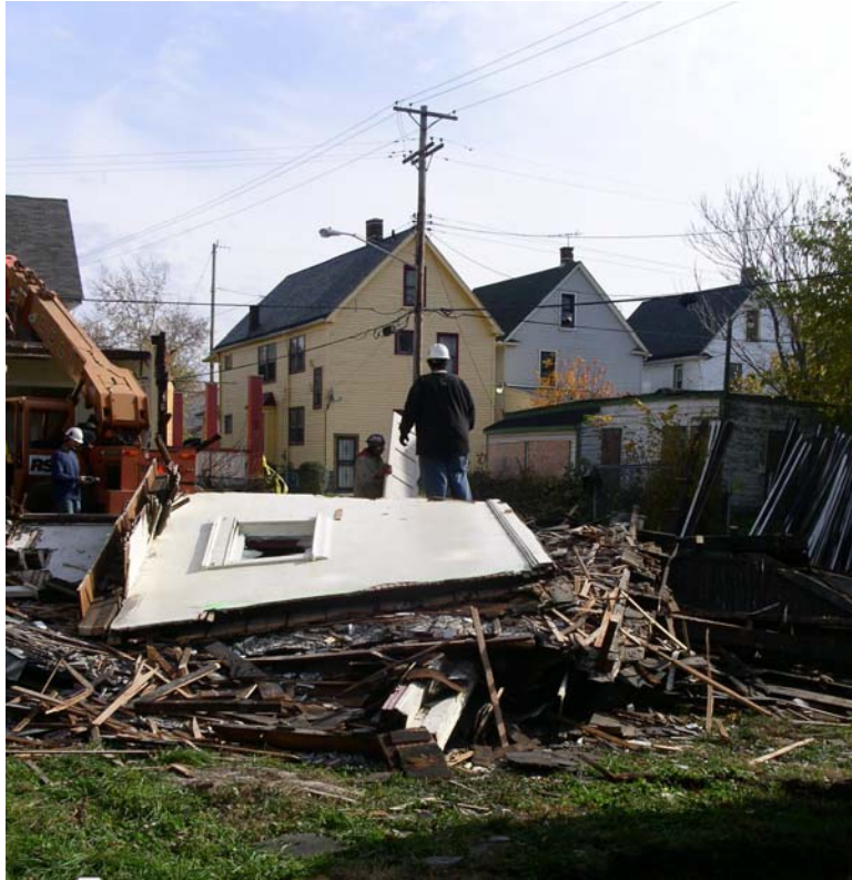
Photo 3 – Cleveland Deconstruction Initiative – Panel Placement for Hand Dismantling