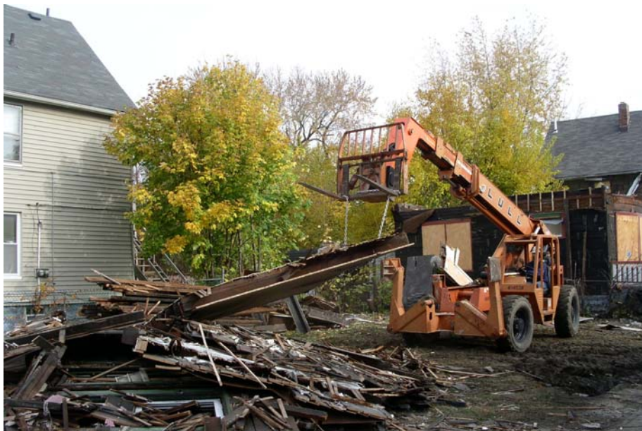
Photo 6 – Cleveland Deconstruction Initiative – Wall Panel Placement for Dismantling