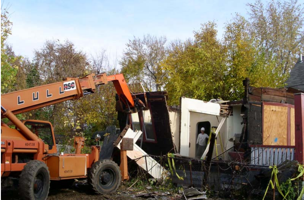
Photo 1 – Cleveland Deconstruction Initiative – Removal of House Panel