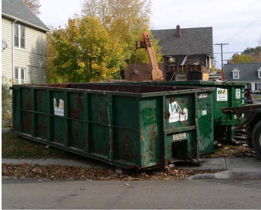
Photo 7 – Cleveland Deconstruction Initiative – Reclaimed Material Storage